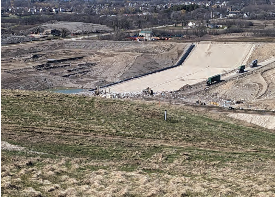
Phase 3 receiving waste. Select waste fluff layer being placed in Southeast corner