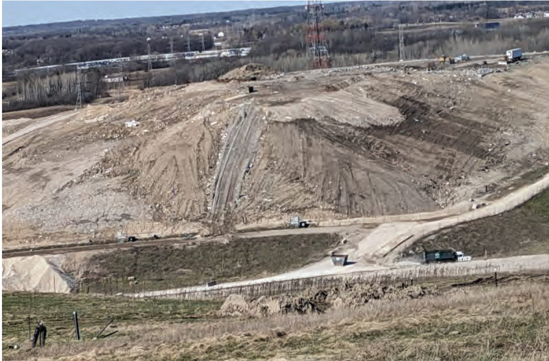
South slope of North Expansion West, fully coveredf in intermediate cover