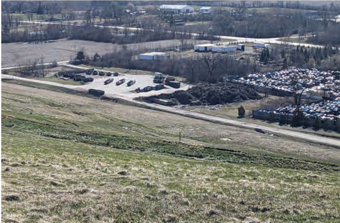
Resi-drop-off; site cleaned