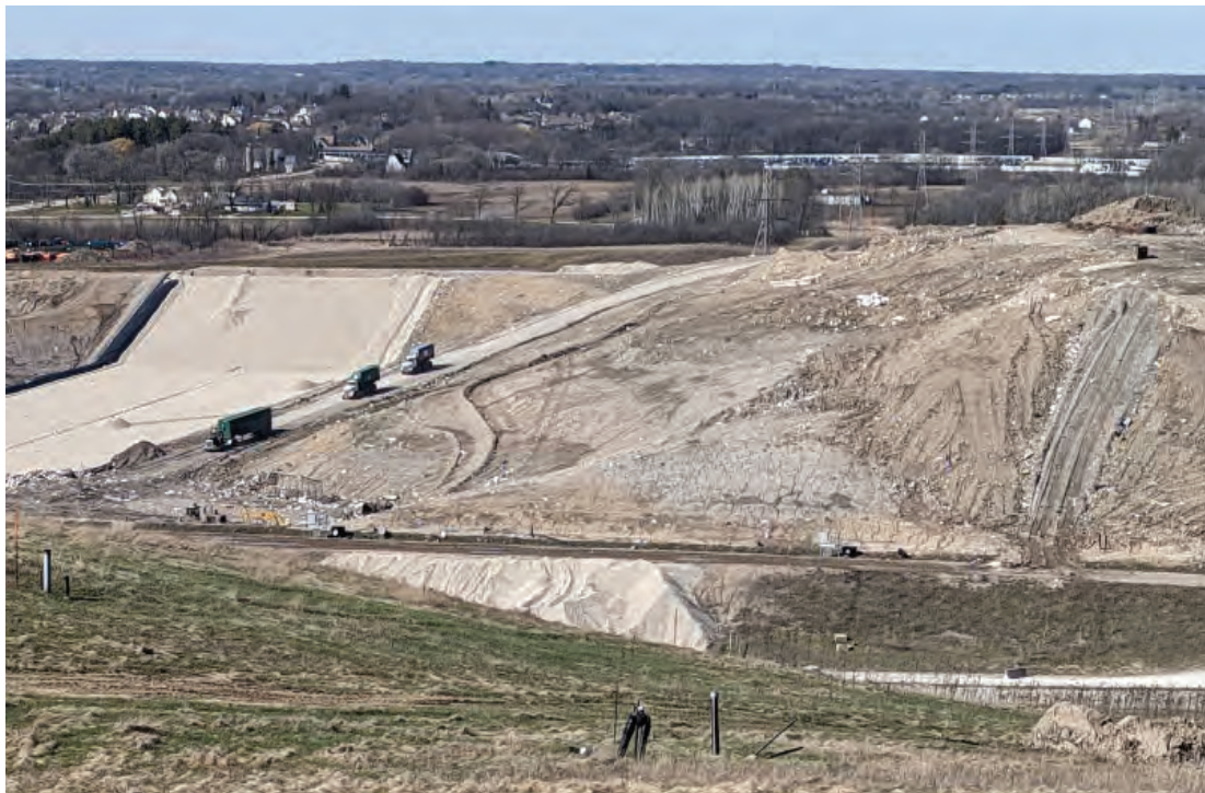
Access to new cell around Phases 1 & 2; receiving fluff layer