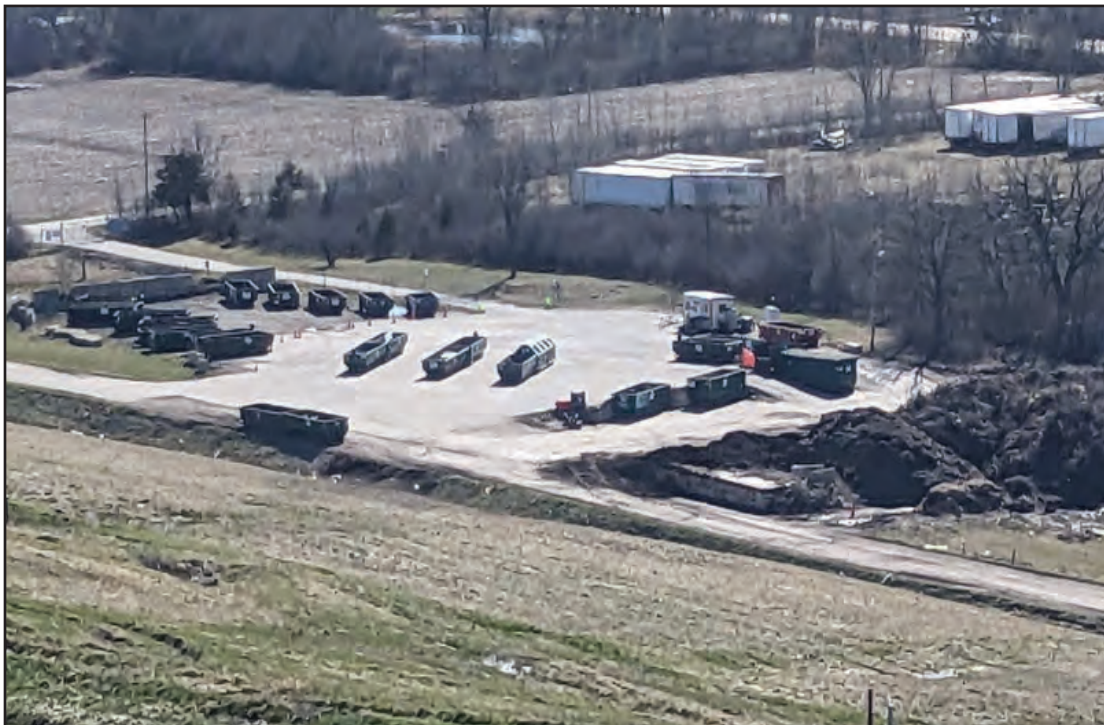
Resi-drop-off; boxes emptied