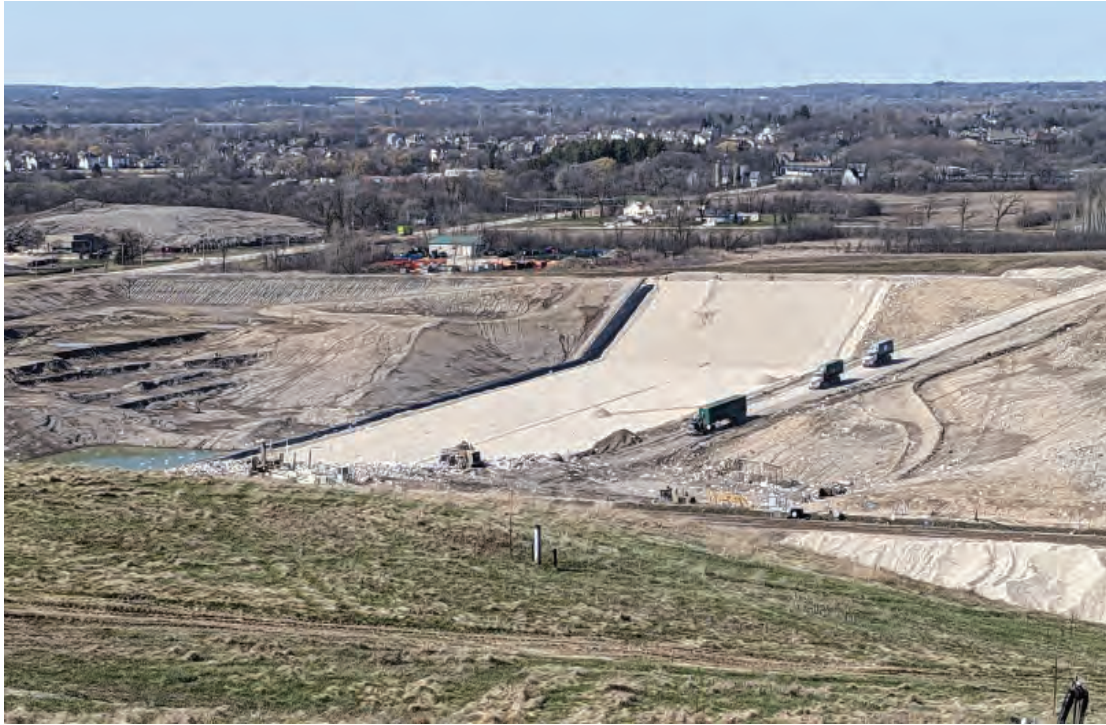
Phase 3 receiving waste. Select waste fluff layer being placed in Southeast corner