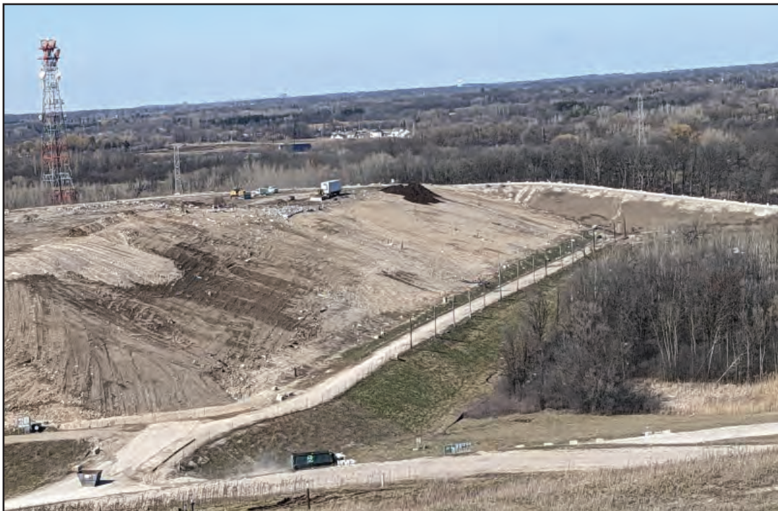
East slope of North Expansion West, fully coveredf in intermediate cover